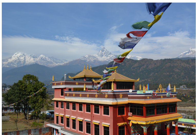
Buddhist Monastery looking out towards Annapurna Ranges

With an extended thank-you to the Pat Farry Trust for their support, this report intends to bring together the important experiences and knowledge I have gained from my three months in these two amazing countries.