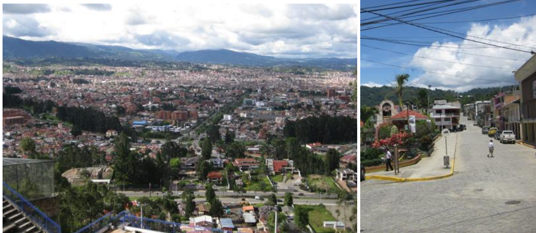
Left: Cuenca, Ecuador – third largest city. Right: Guayaquil – Amazonian basin

Ecuador is a South American country, found in the northwestern corner, straddling the Equator. It has a population of approximately 16 million, with over 87% of the people aged between 0-54 years (median age 26 years). Current life expectancy is 75 years. In 2010, 67% of the population lived in an urban area 1 . The majority ethnicity is Spanish decent. Consequently, the main language spoke is Spanish, however there are minorities groups such as the Quichua and Shuar people who speak other languages. The dominant religion is Roman Catholic – with 92% of the country reporting a religion, and of those, 80% are Roman Catholic.