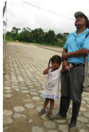
Waiting for her brother

Once the final patient list is created, they all must be fitted into daily operating lists. Often, the surgeons will start in the morning, and keep operating until they run out of patients – which can be as late as midnight. Most operations are performed with spinal anaesthesia – as this is both cheaper and less risky than a general anaesthetic, along with the added benefit of faster recovery (and thus time to discharge).