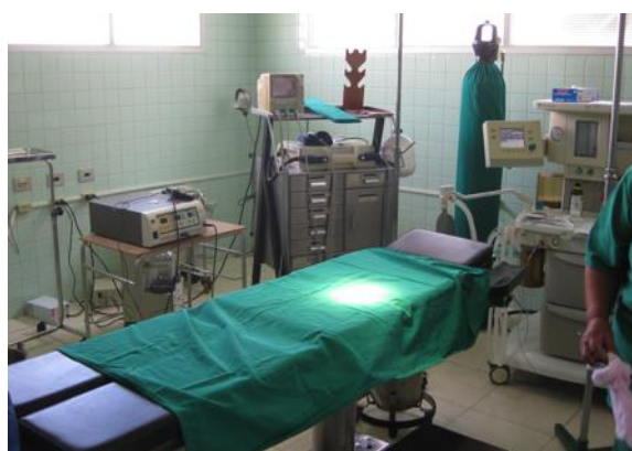
Right: Standard hospital operating theatre equipment