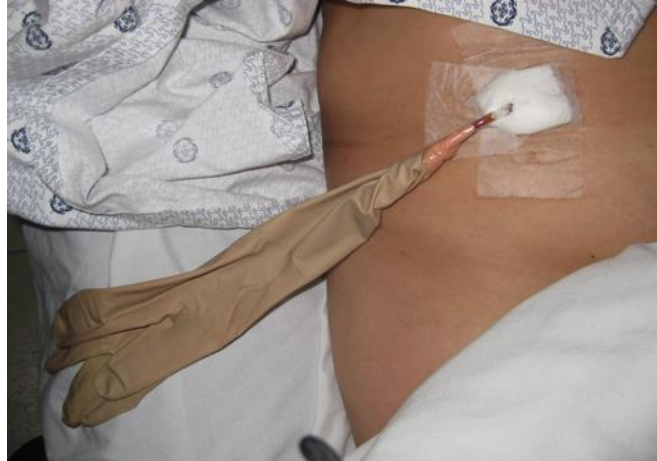
Left: Operating in action. Right: Making use of scarce resources – a drain made of a catheter and surgical glove

In the time I spent with Cinterandes, we travelled to two small towns.