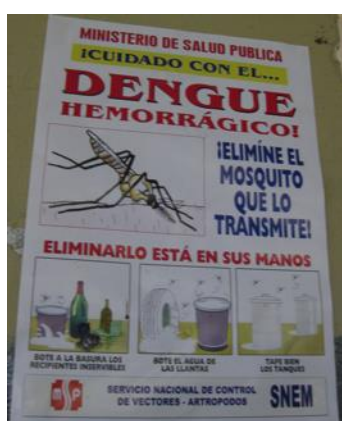
Left: Dengue Fever educational poster.

The Ministry of Health structure is weakened at the moment due to lack of appropriate funding and is consequently struggling to lead the health sector. A major issue is that doctors under the Ministry of Health are only employed 4 hours / day and paid low monthly wages. There is a huge shortage of staff in rural areas. As a way to combat this, junior doctors (often first year out of university) are bonded to work in a rural area for at least one year. While this does ensure doctors are available to an area, they are usually extremely inexperienced, and lacking more senior supports. Thus the combination of economic and geographical barriers means the rural people (often indigenous) are the ones who are missing out. 6